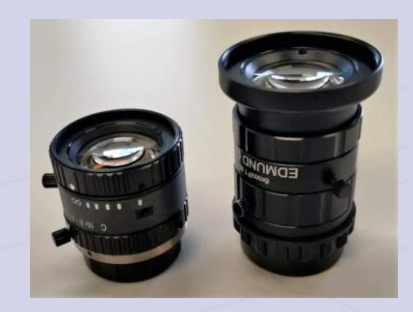
Multiple Optical Configuration C or CS mount compatible

Biodiversity Mucilage Commercial fish species Invasive marine species Jellyfish invasion earlywarning Underwater geological structures Marine protected areas Pipeline integrity Wrecks detection.